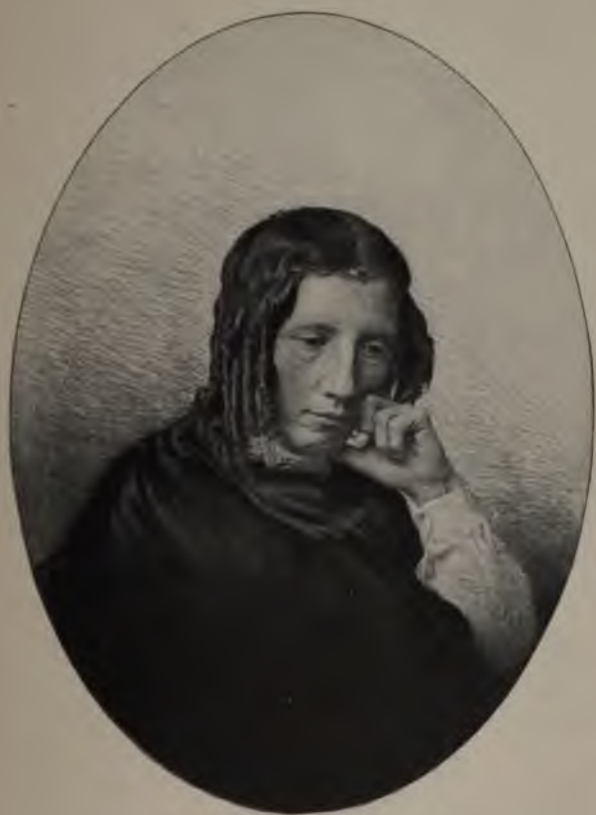
HARRIET BEECHER STOWE